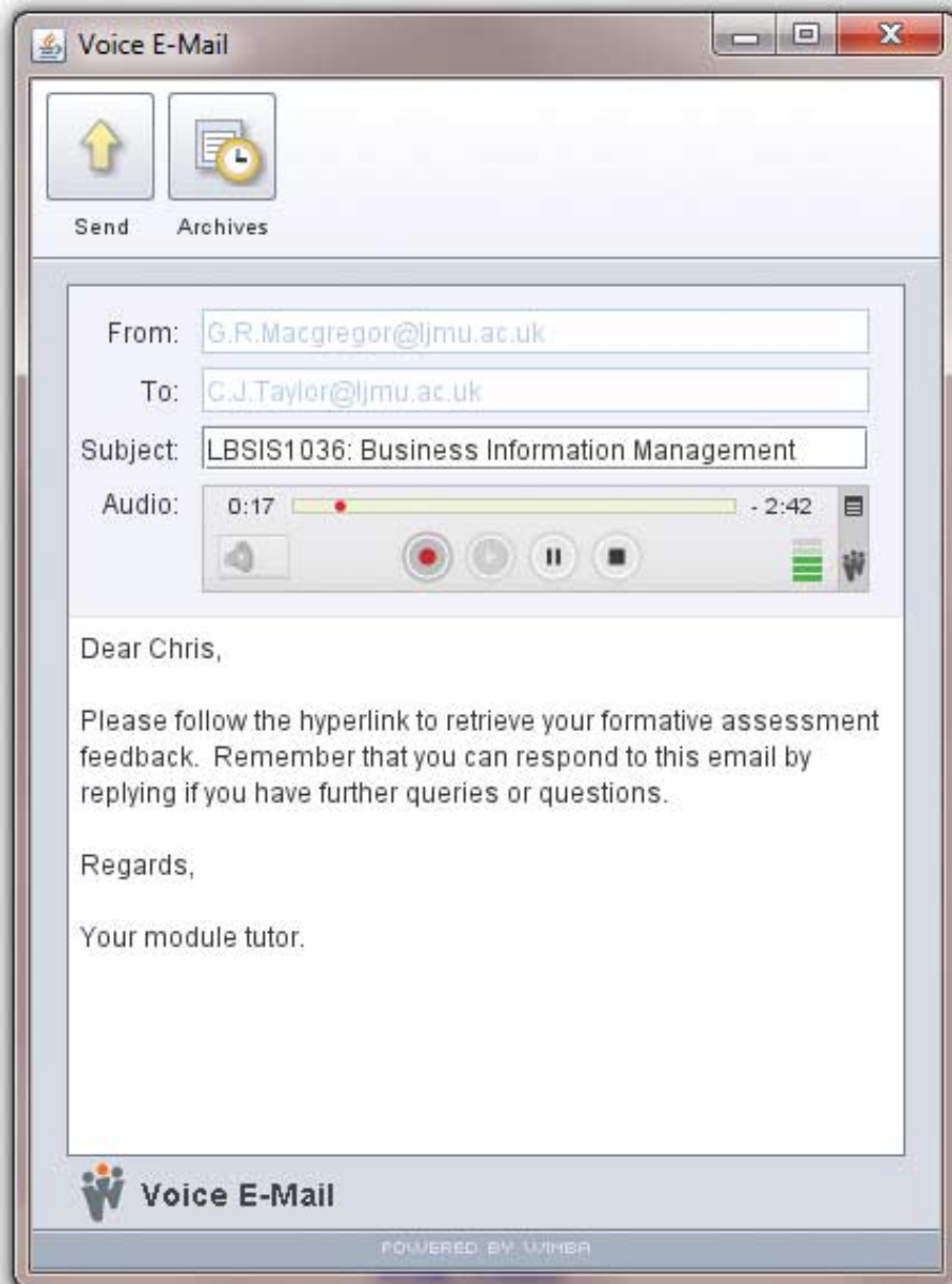
Figure 1. Creating a 'voice email' using Wimba Voice™.

was recorded by tutors based on the agreed marking criteria. This mark remained undisclosed to students.