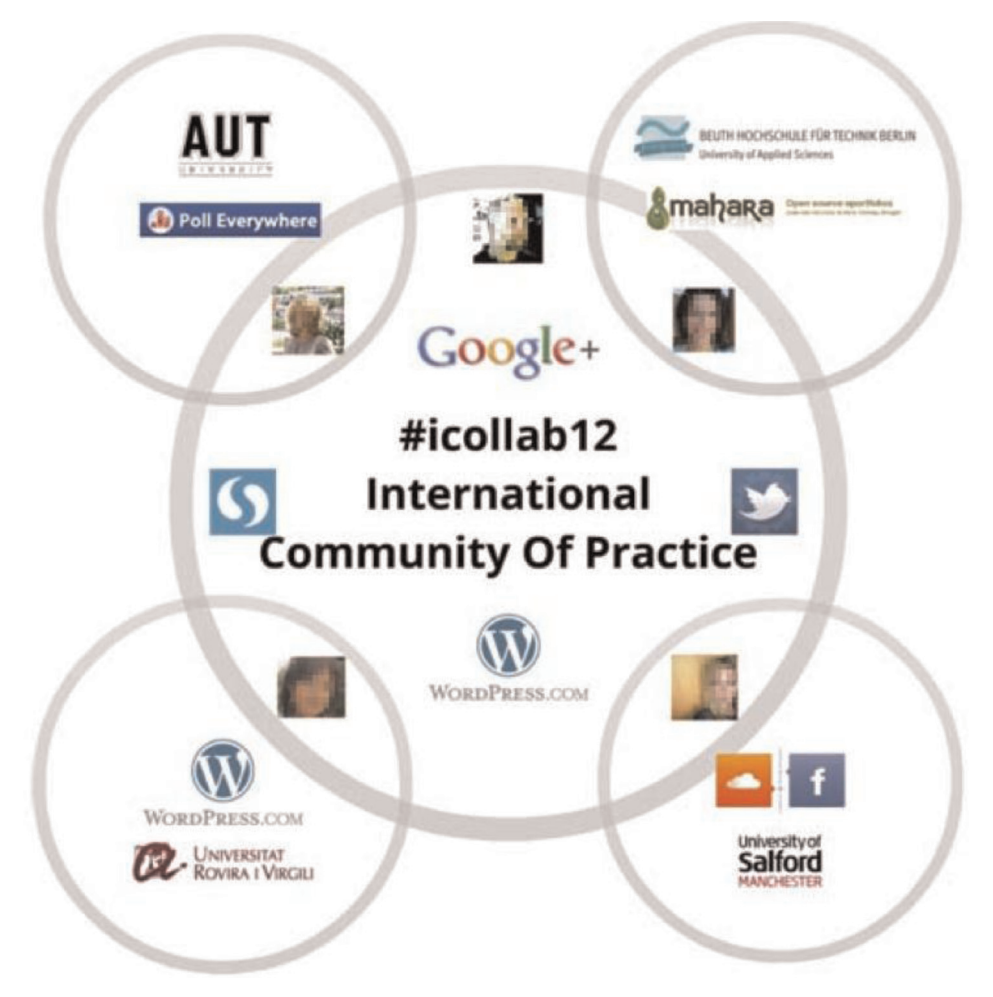
Figure 2. The icollab12 CoP.

streaming via Qik or Bambuser and live feedback via Twitter, pre-recorded YouTube videos, Slideshare or Wordpress. At the end of the project, students in each country were asked to vote for the best "Social Media" report (see http:// tinyurl.com/dyp9trp), and the winners received an iTunes voucher. Polleverywhere was used as a mobile voting system for the participants to vote for the best student social media reports. This project was further refined in 2013 and expanded with the addition of a group from Ireland and is curated at http://icollab.wordpress.com (Figure 2).