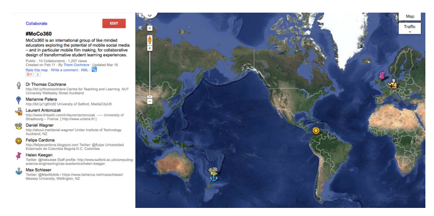
Figure 4. Google Map of #moco360 lecturers.

framework for BYOD we also share how we have enabled infrastructure changes to support the implementation of this framework, including the custom designed MOAs.