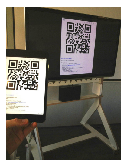
Figure 5. Mobile Airplay Screen.

Space has limited us to the inclusion of only two examples of how we are implementing our framework for creative pedagogies within wider contexts. Both the #marmw2013 and the #MoCo360 communities of practice are on-going and in the early stages of development, but we can already see evidence of a significant impact on the multiple curriculum contexts involved as they apply our framework for creative pedagogies using mobile social media. Driven by our two research questions, an in-depth evaluation of these two projects will be undertaken at the end of 2014, and this will inform the development of a set of design principles for implementing a framework for creative pedagogies using mobile social media and student-owned devices.