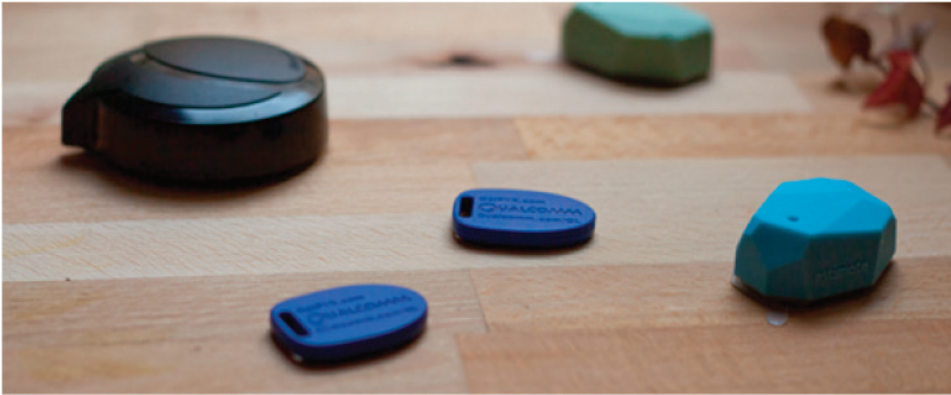
Figure 1. Some beacons made by different manufacturers.