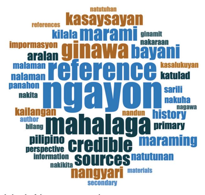
Figure 1. Word cloud of the most commonly occurring responses.

The words, which were initially identified through the word cloud, also served as the basis for listing 42 codes (Table 2, listed in the first column). The codes were generated based on the recurrent patterns of ideas concerning the promotion of historical understanding through digital storytelling. The codes were grouped into eight clusters (listed in the second column) to identify the emerging basic themes that were common across all the qualitative data. Eventually, the clusters with shared characteristics and issues were categorised into six organising themes (listed in the third column).