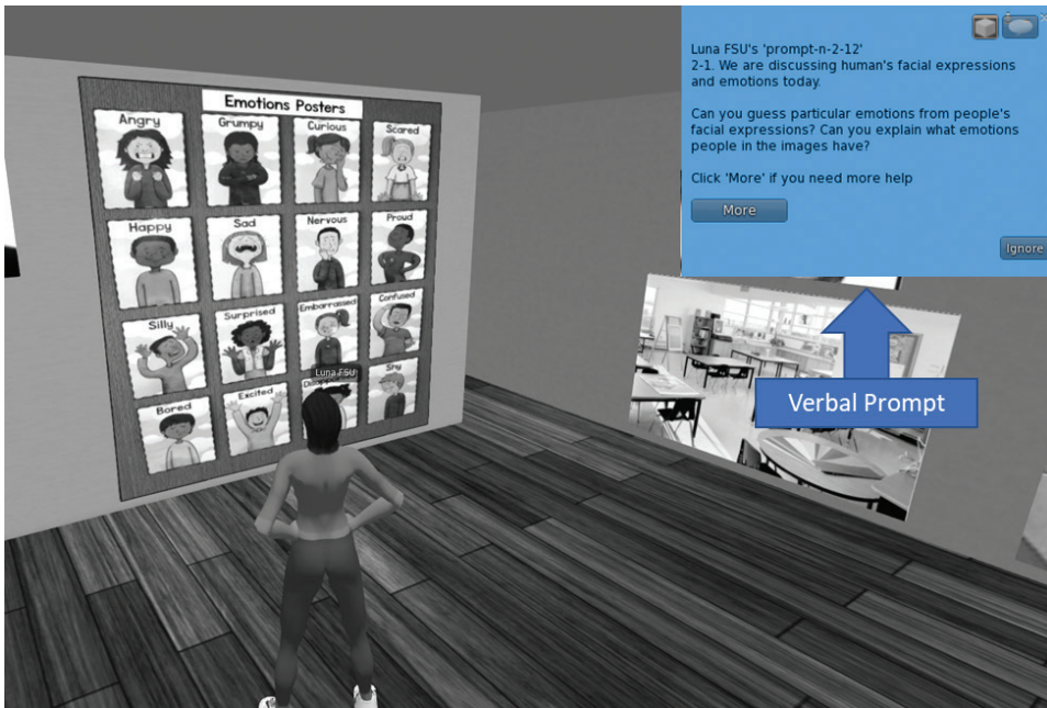
Figure 2. A screenshot of a blue dialogue box as a verbal prompt.